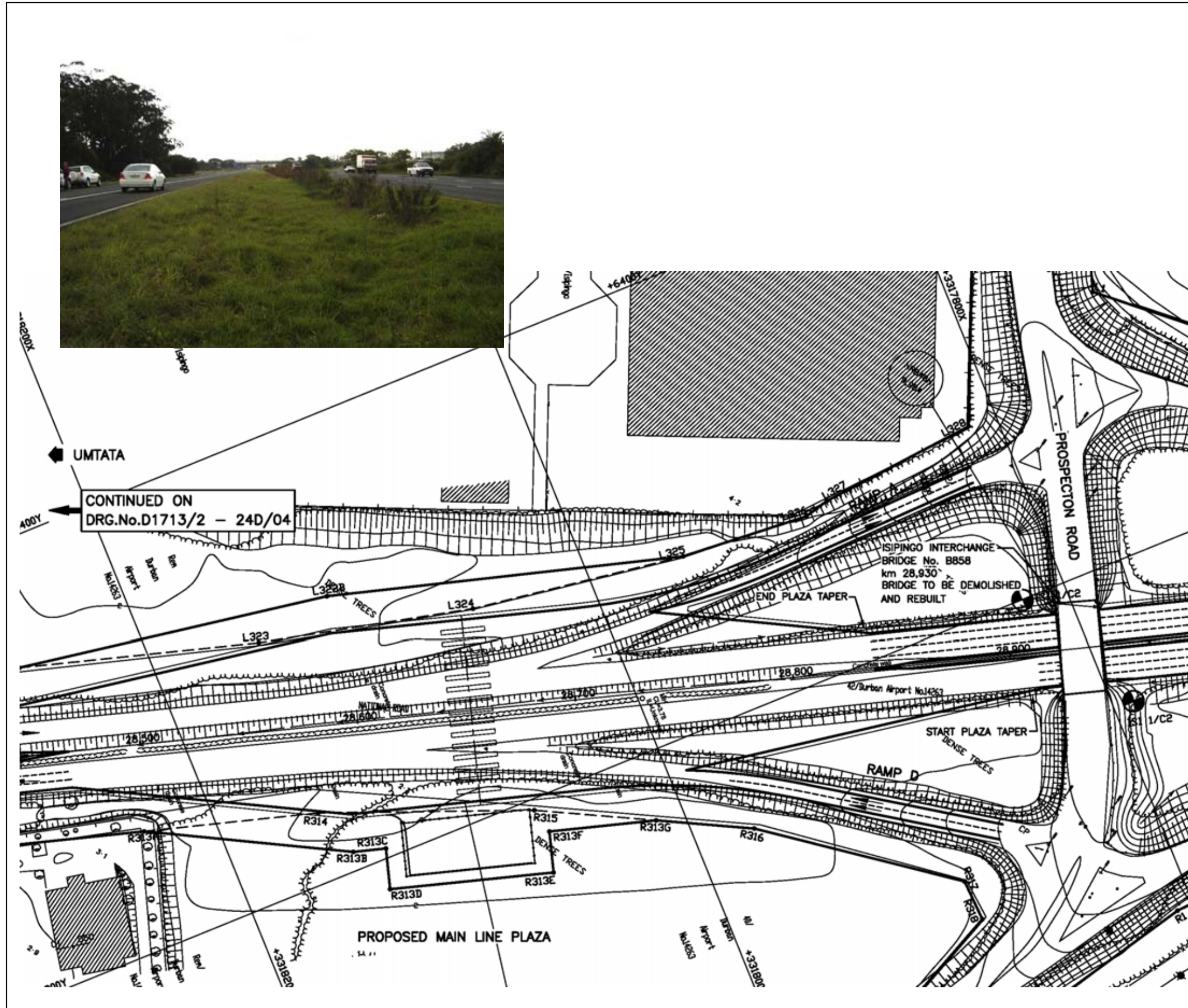
Figure 4.32: Plan and photograph showing the layout and location, respectively, of the proposed Isipingo Mainline Toll Plaza