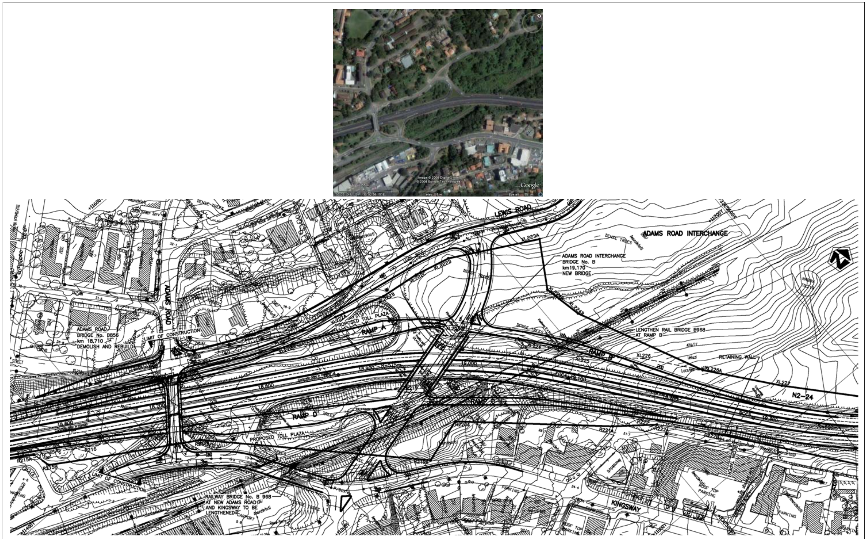
Figure 4.30: Plan and satellite image showing the layout and location, respectively, of the proposed Adams Road Interchange