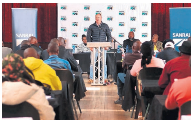
Major roads maintenance project extended to Mangaung.

Just over 1 200 kilometres of the province's roads were transferred to SANRAL between October 2023 and November 2024. These roads will be fully managed by SANRAL's management in the Free State. SANRAL is also in the process of opening a provincial office in Mangaung. This is in line with the roads agency's decision to move the organisation from a regional-office based model to a provincial-office based one. The opening of the Mangaung office will also allow SANRAL to enhance its stakeholder engagement endeavours with the Free State Provincial Government, municipalities and the various communities that are affected by its projects.