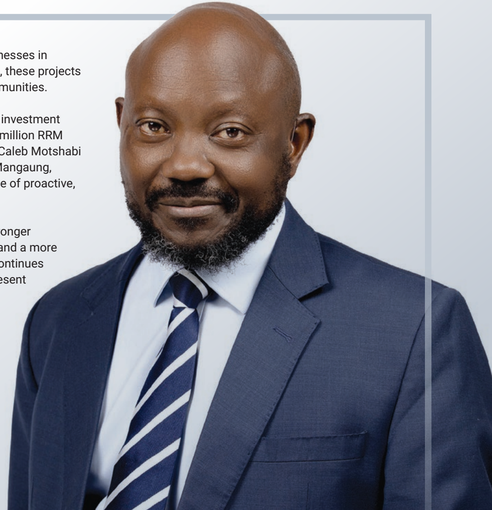
Reginald Demana SANRAL CEO

Better roads pave the way for stronger economies, safer communities, and a more connected nation. As SANRAL continues its work, these investments represent a crucial step toward sustained, nationwide infrastructure renewal, one road at a time.