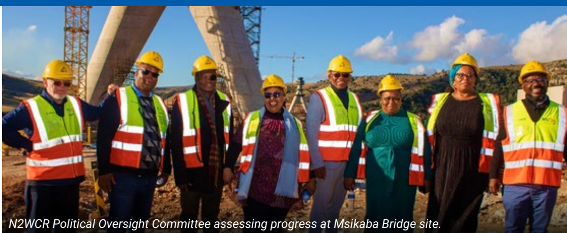
N2WCR Political Oversight Committee assessing progress at Msikaba Bridge site.

The Political Oversight Committee (POC) of the N2 Wild Coast Road (N2WCR) conducted an oversight visit to the project in July. Led by the MEC for Transport and Community Safety, Mr Xolile Nqatha, the POC visited the Msikaba Bridge construction site, and held an engagement session with local key stakeholders, including affected traditional leadership, women in business, business forums and N2WCR Project Liaison Committee (PLC) members.