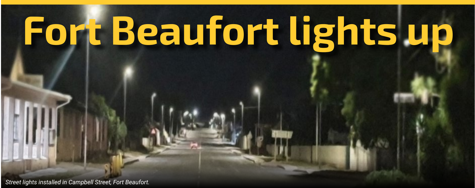
Street lights installed in Campbell Street, Fort Beaufort.

The community of Raymond Mhlaba Local Municipality is set to benefit from the upgrades that SANRAL has carried out along the R63 from Fort Beaufort to Alice.