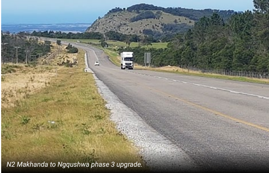
N2 Makhanda to Ngqushwa phase 3 upgrade.

As part of a comprehensive plan to enhance the quality of the National Route N2 between Gqeberha (Port Elizabeth) and Qonce (King William's Town), the South African National Roads Agency SOC Limited (SANRAL) is upgrading several sections of the road.